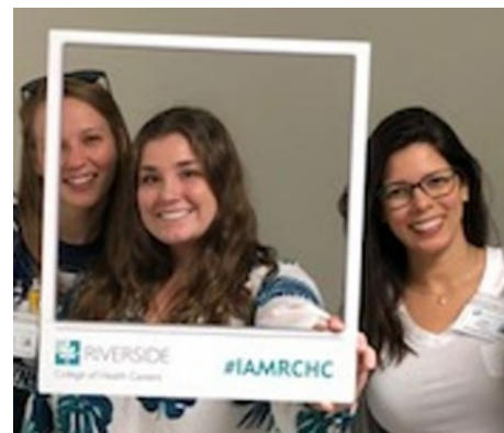
Pictured above: A group of students.