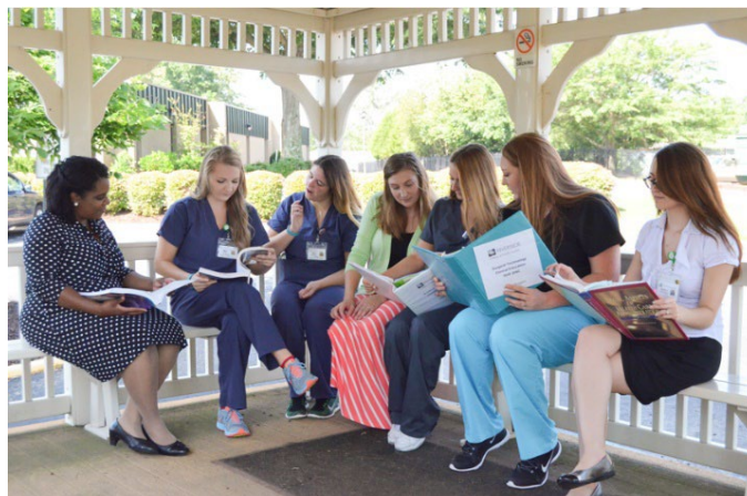
Pictured below: A group of students studying.