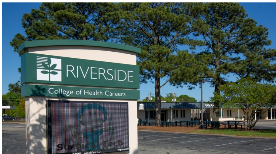
Pictured: College sign on Main Street

Applicants are not required to take pre-requisite or co-requisite courses from RCHC/Geneva and may transfer courses from any accredited institution to RCHC for consideration upon application for their degree or certificate program of choice.