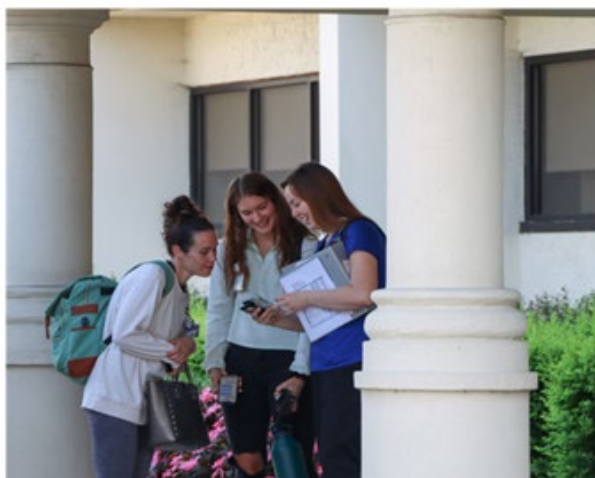
Pictured: Students on campus.