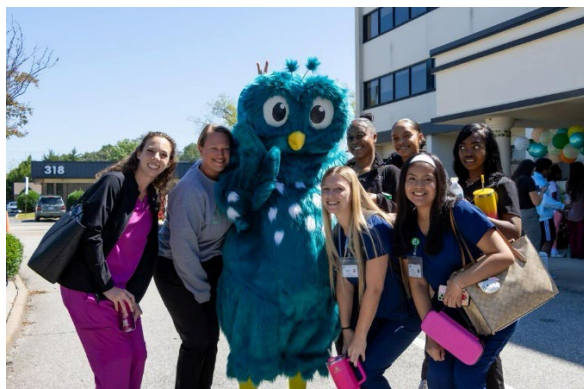
Pictured: Students on campus with Athena, our school mascot.