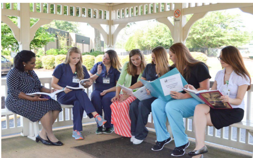
Pictured: A group of students studying on campus.