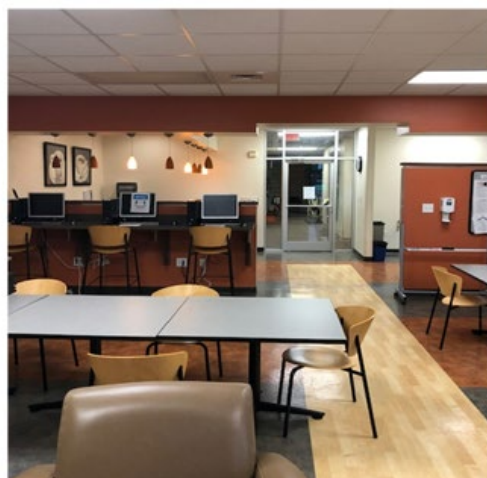
Pictured: Treehouse Café