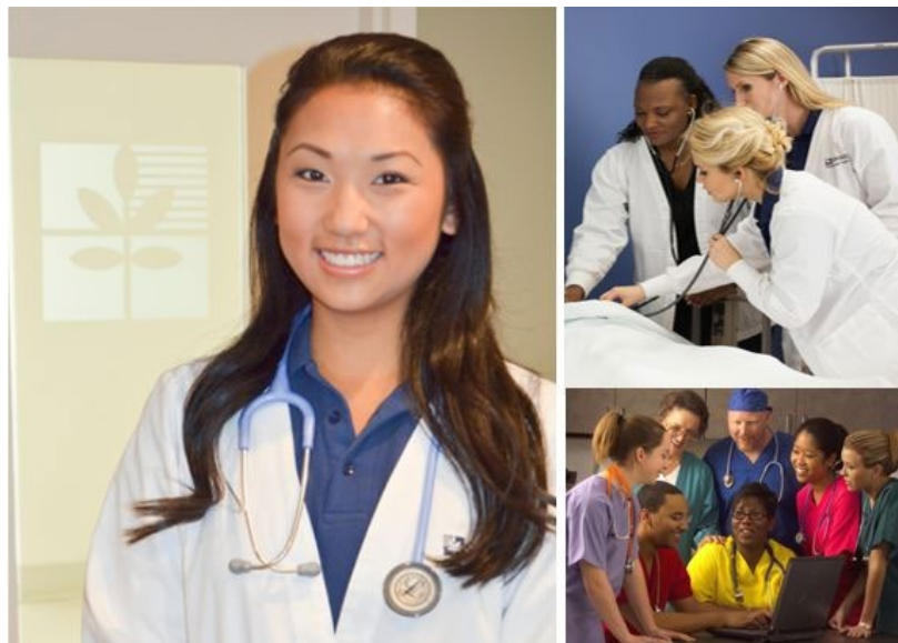
Pictured left: Student in clinical; top right: students practicing skills in the Nursing Skills Laboratory; bottom right: students and faculty in Nursing Skills Laboratory.

The Programs of the College are designed to meet the educational requirements for licensing or certification that are required for employment. State requirements for credentialing vary; in addition to educational requirements, an agency or board may require additional criteria be met. If you are physically located outside of Virginia, or intend to practice in another state, we encourage you to contact the state board or agency in the state in which you plan to practice for the most complete and up-to-date information pertaining to licensure and certification. Contact information for state licensing agency bodies can be found at CareerOneStop.org .